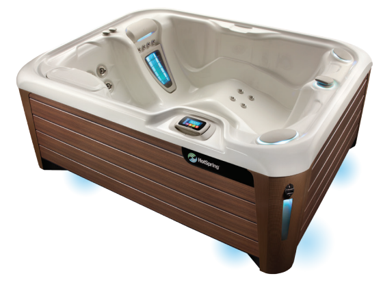
Jetsetter NXT shown with Alpine White shell / Mocha cabinet