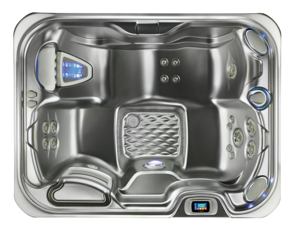
Jetsetter NXT shown with Platinum shell